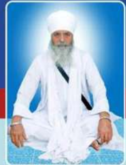
ਸ੍ਰੀ ਗੁਰੂ ਗੋਬਿੰਦ ਸਿੰਘ ਜੀ ਜੀਦਤੋ ਵਾਲੇ

Affiliated to PSEB Mohali M. 82880-50100, 99143-03013 English Medium